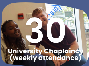
University Chaplaincy (weekly attendance)