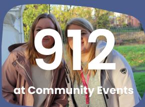
at Community Events