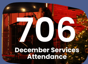
December Services Attendance