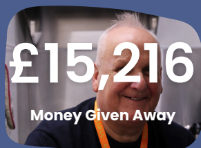
Money Given Away