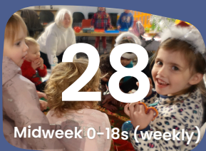
Midweek 0-18s (weekly)